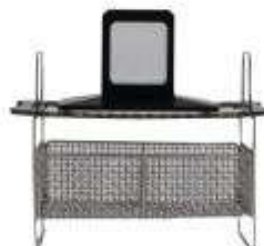
Mesh basket & Jig