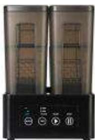
Main body & Wash container