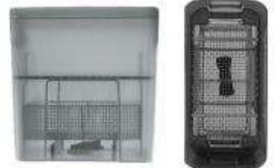
Translucent wash container